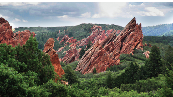
Wed, April 17-May 1 at 10 p.m. on WETA PBS & WETA Metro Three-part NOVA series Making North America presents a sweeping biography of the continent. Above: Roxborough State Park, Colorado.