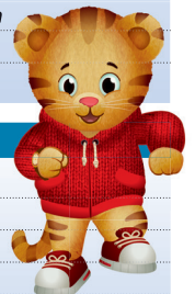
Daniel Tiger's Neighborhood