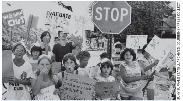
Monday, April 22, 9:30 p.m. on WETA PBS (9 p.m. on WETA Metro) American Experience: Poisoned Ground: The Tragedy at Love Canal explores a notorious U.S. environmental and public health disaster. Above: Love Canal youth-residents hold protest signs, June 1980.