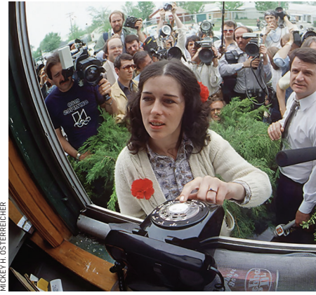
Activist Lois Gibbs waits for a call from the White House, May 1980.