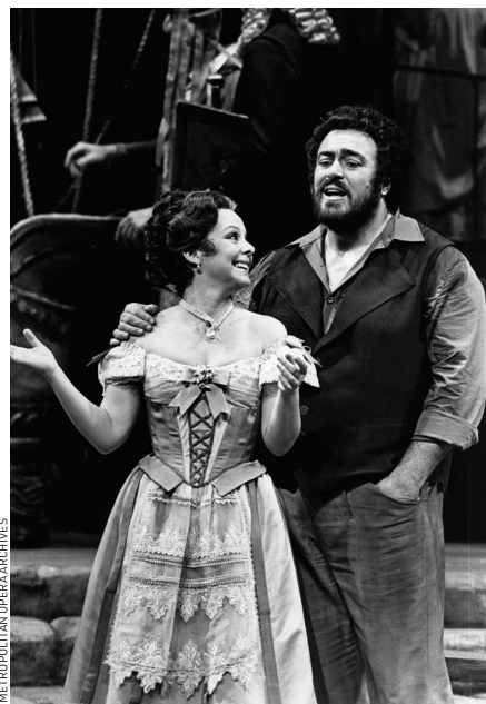
Judith Blegen and Luciano Pavarotti in Donizetti's L'Elisir d'Amore

Airing April 20 is Puccini's beautiful and bittersweet love story, La Rondine , a tale of romance between the idealistic Ruggiero and the former courtesan, Magda, whose past life threatens their future. This Met Opera live performance features Angel Blue and Jonathan Tetelman. Closing out the month's operas on April 27 is a spring 2024 presentation of Terence Blanchard's Fire Shut Up in My Bones , based on Charles M. Blow's memoir spotlighting the life of a young man as he navigates adolescence and struggles to overcome trauma. This Met presentation features Ryan Speedo Green in the principal role.