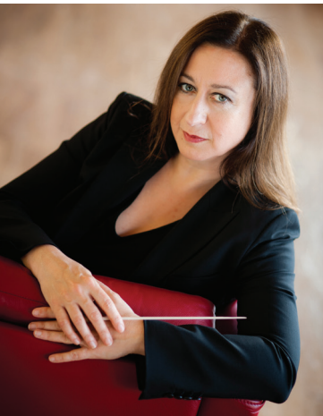
Conductor Simone Young