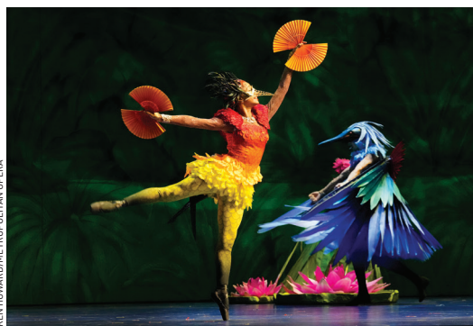
Florencia en el Amazonas , April 7 on WETA PBS