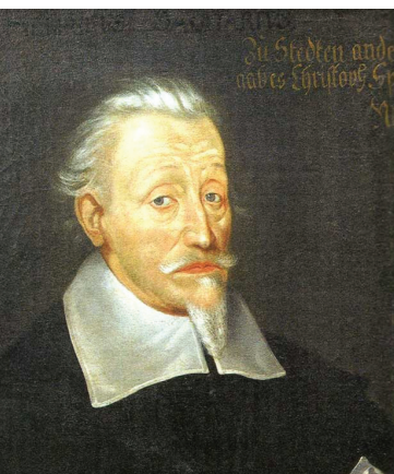
Composer Heinrich Schütz

Three works and three conductors are featured on WETA Classical's NSO Showcase this month, spotlighting performances by the National Symphony Orchestra. The April 3 program opens with Alexander Glazunov's Concert Waltz No. 2 , led by Japanese conductor Kazuki Yamada. Maestro Yamada is Chief Conductor and Artistic Advisor of the City of Birmingham Symphony Orchestra and holds a similar position at l'Orchestre philharmonique de Monte-Carlo. Then, Gianandrea Noseda leads the NSO in Schubert's effervescent Third Symphony, written when the composer was just 18 years old. The work contrasts greatly with the program's final offering, Shostakovich's Symphony No. 10 , which the composer claimed was "about Stalin and the Stalin years." It was first performed in 1953, the year of the dictator's death. Simone Young conducts.