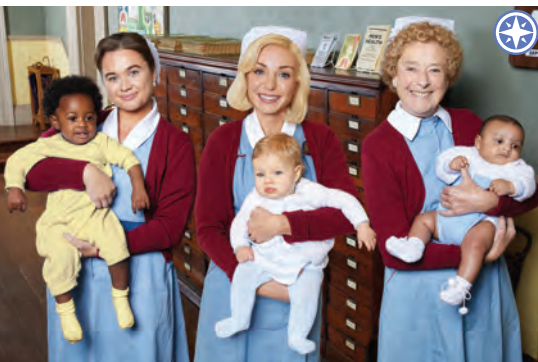
BIG STUDIOS/REAL STREET PRODUCTIONS