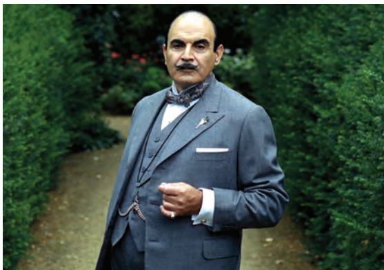
Thursdays, March 21 & 28 at 7:59 p.m. on WETA PBS Agatha Christie's Poirot stars David Suchet in his signature role as the author's Belgian super-sleuth in double features on WETA Thriller Thursdays that include the famous case Death on the Nile .

7:00 PBS NEWSHOUR – Weeknights. Visit pbs.org/newshour . Repeats next day, 7am 8:00 DANTE: INFERNO TO PARADISE – A landmark documentary by filmmaker Ric Burns explores the life and times of Dante Alighieri (1265-1321) and his soaring masterpiece "The Divine Comedy" – one of the greatest achievements in the history of literature. Part 1 of 2. The Inferno. Repeats Tue 3/19, 3pm; Sat 2/23, midnight