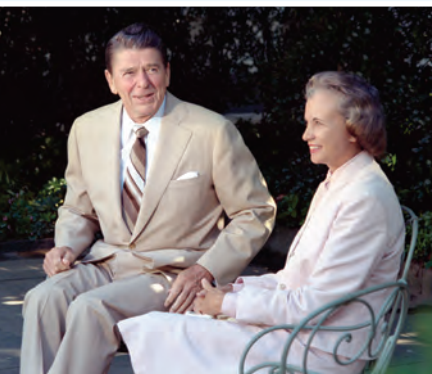
RONALD REAGAN PRESIDENTIAL LIBRARY

pioneer overcame prejudice and financial hardship to become a voice for justice, an internationally renowned master of her craft, and the first African American to sing a leading role at the Metropolitan Opera.