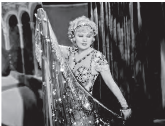
(M) NO ANGEL, 1933

Monday, March 11, 10 p.m. on WETA PBS; 9 p.m. on WETA Metro American Masters: Mae West examines the life and legacy of the notorious entertainment icon – writer, performer, and subversive star – who "climbed the ladder of success wrong by wrong."