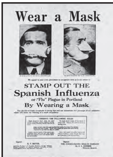
1919 Oregon public health message

Also airing this month is an encore presentation of the two-hour NOVA special Polar Extremes (March 20, 9 p.m.), which follows renowned paleontologist Kirk Johnson (head of the Smithsonian National Museum of Natural History) as he explores what the past can reveal about our planet's climate future.